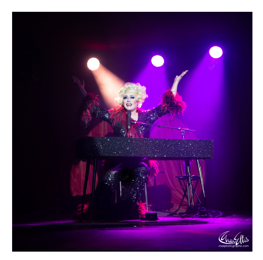
Due to some gently mature content the show is suitable for anyone aged 13+.

Women of a certain age especially fall for Hope's glamour encrusted vulnerability. But so do their husbands, sons and daughters. There is even a following in the classical world and often there is a table of Anglican vicars who are firm fans. This story of a woman's struggle to make something of herself in show business and the highs and lows along the way connect with audiences on every level. Segments of the show were at one time presented to WAC (Weekend Arts Club) at the Bush Theatre London to an audience of disadvantaged mixed race and ethnic minority kids from the age of 13-18 and they loved Hope - she went down a storm.